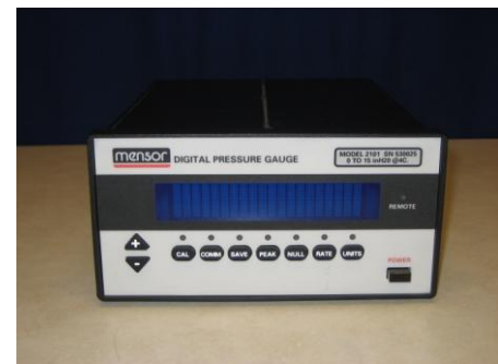
PRESSURE-411 photo featured