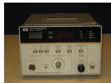
Power Meter ELECTRICAL-HP436A photo featured